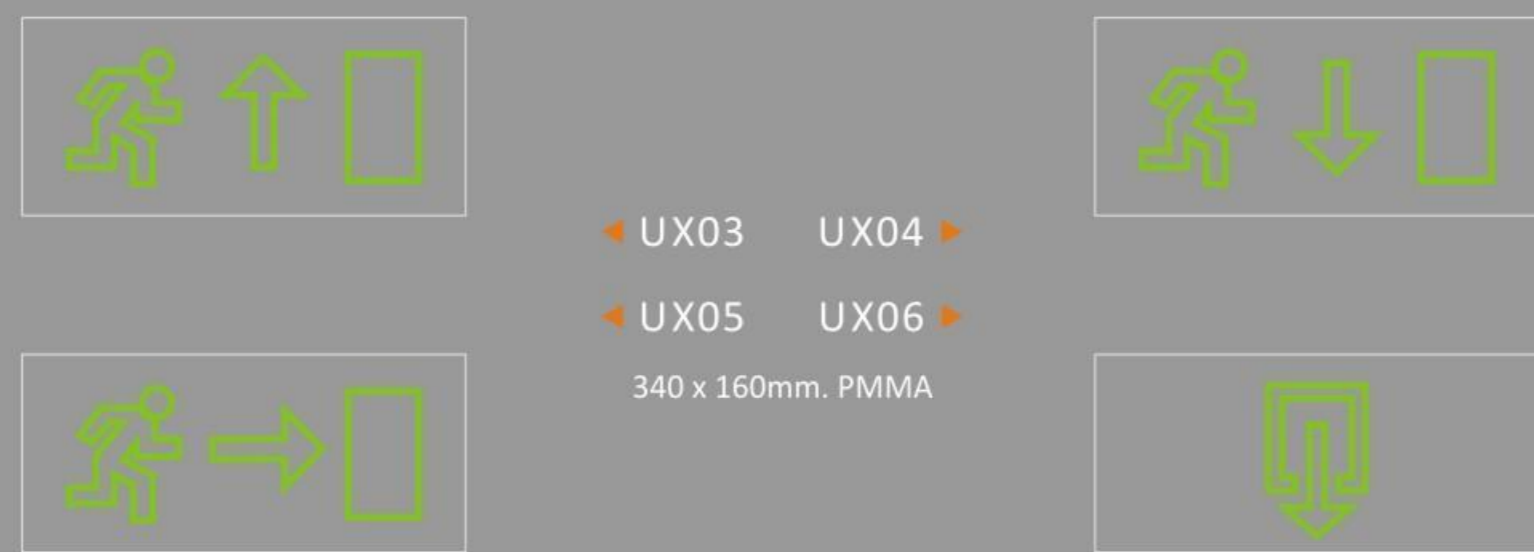
UX03 UX04 UX05 UX06 340 x 160mm. PMMA